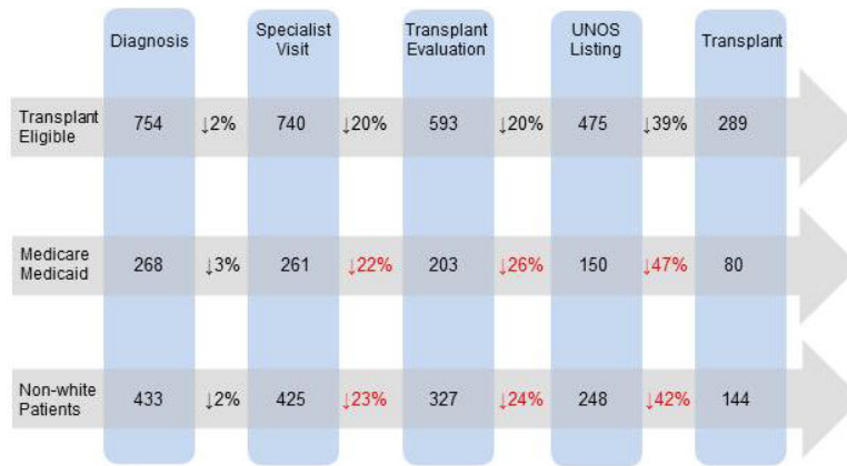
Figure 2. Progress of eligible patients through the pre-transplantation process: individuals with only Medicare or Medicaid, and non-white patients experience greater drop-off rates when compared to all eligible patients