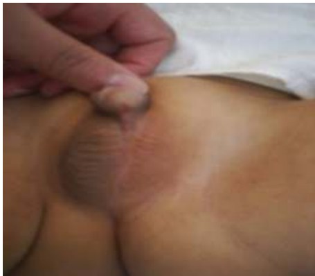
FIGURE 5: Case 2: hypospadias.