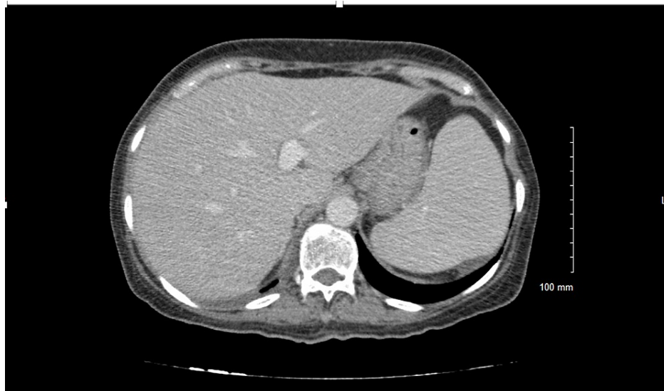
FIGURE 1: CT scan of the abdomen showing hepatosplenomegaly