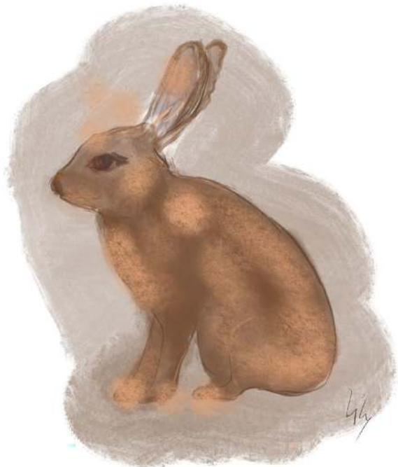
Fig. 1 The Manifesto and multimodality