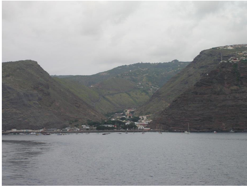
Plate 1.0: St Helena’s capital Jamestown nestles in a steep valley between barren cliffs.

Another interviewee described the island as having “nothing but vast amounts of British aid” (Interview, UK, 25, 2011). St Helena has few natural resources. Steep volcanic cliffs surround the Island and render more than fifty percent of the island unsuitable for agriculture (St Helena Government, 2010).