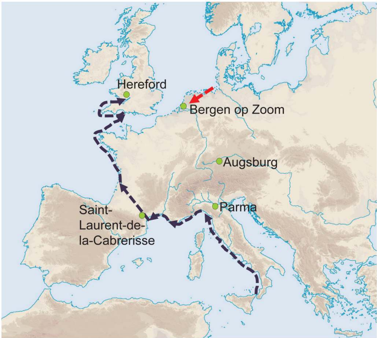
Figure 1. Geographical position of the five archaeological sites investigated. Green dots indicate the sites. Also indicated are two likely independent infection routes (black and red dotted arrows) for the spread of the Black Death (1347–1353) after Benedictow [25]. doi:10.1371/journal.ppat.1001134.g001

Similar to the aDNA results, antigen was not detected in negative control samples or in soil samples from those sites (Tables 1 and S1).