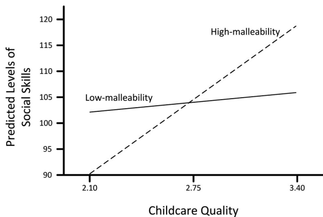
Figure 3. Predicted levels of social skills for the low-malleability and high-malleability groups as a function of childcare quality.

In supplemental analyses, we also tested whether child sex moderated results shown in Table 1. That is, we modified Equation 16 to include the effect of sex in a fashion analogous to that for Equation 19. Relative to females, males had a slightly lower estimated crossover point, \hat{C}_s = -0.12 ( SE = 0.24 ), and a somewhat lower level of social skills at the crossover point, \hat{A}_{0s} = -0.17 ( SE = 1.84 ). Also, males were slightly less affected than females by child care in both the low-malleability, \hat{B}_{1s} = -2.37 ( SE = 5.77 ), and high-malleability groups, \hat{B}_{2s} = -13.27 ( SE = 11.10 ). But, none of these effects was statistically significant, as t -values ranged between |0.41| and |1.20| (all ps > .20 ). Although accepting the null hypothesis can be a risky gambit, the present data provide no evidence that results differed significantly by child sex.