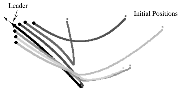
Fig. 3. Trace of the vehicles while forming and keeping a wedge shaped formation.