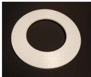
Figure 2. Example of flexible 3-D printed automotive related part, 2" gasket—shown enlarged for clarity.

The results of the 3-D prints with flexible filament were tolerable with a standard successful print for each print job as judged by function. Cura Lulzbot edition has predefined settings for NinjaFlex and these presets were used in order to represent the mostly likely printing settings by inexperienced consumers. The use of presets makes it straight forward for beginners to get started printing flexible objects. With the “quick print” settings enabled, users select the quality to be either high detail, normal or high speed. These selections mostly effect layer height and was altered on larger items like the hammer ergonomic grip, which was made with large layers to reduce printing time. The printing parameters that had a large effect on the end part was shell thickness and infill percentage. For the automotive related parts like the O-rings, gaskets and belts, the parts were printed with thick shells (1.2 mm) and low infill (20%). This provided an overall strong part with more flexibility. Shown in Figure 2, as a representative print, the average visual quality of the part was excellent.