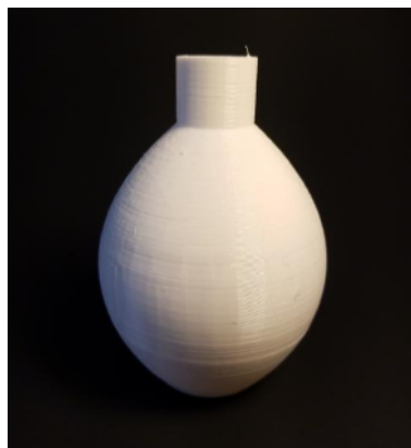
Figure 5. Example of medical device component: newborn medical ventilator bag.

Finally, the medical device in Figure 5 was printed at 50% infill with thinner shells because it needed to be robust and strong, but still flexible and light. This is another large print that was printed at a slightly lower layer height (0.25 mm). The print worked well and had only a light amount of stringing on the inside of the part itself that did not interfere with the functioning of the component nor impact in aesthetically.