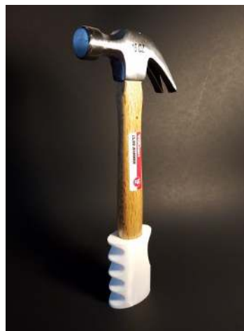
Figure 3. Example of household item, hammer ergonomic grip.

For household parts like the hammer ergonomic grip, thinner shells and less infill gave parts a soft and comfortable feel. Shown in Figure 3, the overhangs in the finger grips printed perfectly. This is an example of a large part with large layers (0.4 mm) to reduce printing time. Even with the visible layers, the part appears aesthetically acceptable.