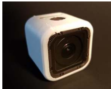
Figure 4. Example of product accessory, GoPro Session Camera Case.

of the detail users can still maintain, which is similar to harder thermoplastics when printing with flexible filament.