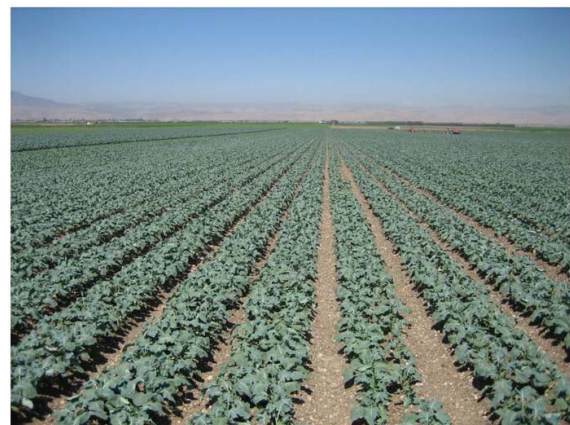
Fig. 2. Organic broccoli production as a monoculture in the Salinas Valley, California. Unlike a diversified farming system (whether certified as organic or not), this organic production system is more like conventional industrialized agriculture, utilizing substantial off-farm inputs such as purchased compost and other soil amendments, “organic” pesticides, etc.

DFS is similar to another concept, ecoagriculture, in recognizing that landscapes, not single farms, are important targets of land management. Other concepts, such as climate-smart agricultural landscapes or integrated watershed management, also make this link ( http://blog.ecoagriculture.org/2012/03/05/terminology/ , accessed Mar 13 2012), each with their own particular emphasis. DFS emphasizes how farming practices operating from plot to landscape scales maintain functional biodiversity and thus ecosystem services. Ecoagriculture emphasizes “landscapes in which biodiversity conservation is an explicit objective of agriculture” (Scherr and McNeely 2008:477). The DFS concept highlights the critical reciprocity underlying the ecoagriculture concept, that is, that the ecoagricultural landscape promotes biodiversity and in turn, critical components of biodiversity (i.e., functional biodiversity) promote agriculture through provision of ecosystem services. In summary, DFS, while closely allied to all of these concepts, places more emphasis upon the relationship between functional biodiversity and ecosystem services.