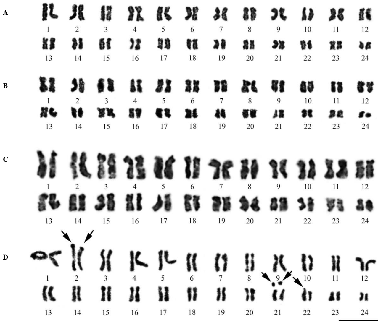
Figure 3. Karyotypes by conventional staining. A. Amomum curtisii , B. A. monophyllum , C. A. trilobum , and D. A. wandokthong . Arrows in B and E indicate satellites. Scale bar = 10 \mu m