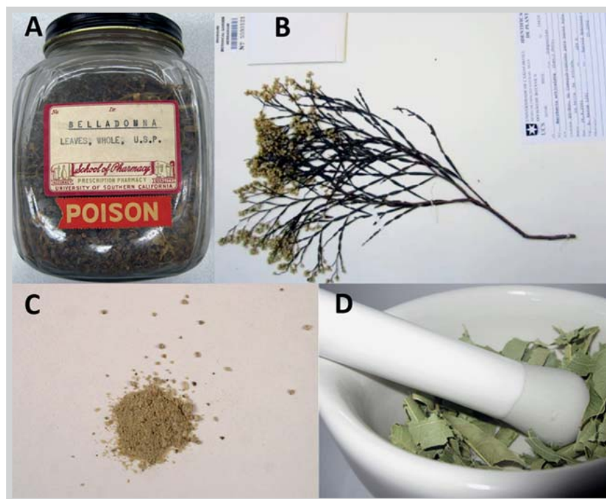
Fig. 1 Examples of the types of plant material used for isolation of DNA and authentication. A Bottle of Atropa belladonna dried leaves, originally from the University of Southern California Pharmacy School. Photo, A. M. Hirsch. B Specimen of Baccharis articulata from the Missouri Botanical Garden Herbarium. Photo, D. C. F. Moraes. C Powder derived from Hoodia gordonii . Photo, M. R. Lum. D Plant material of Baccharis genistoides prior to DNA extraction. Photo, D. C. F. Moraes. (Color figure available online only.)

ments and remedies, and Asia-Pacific and Japan make up the other important markets for these products [7].