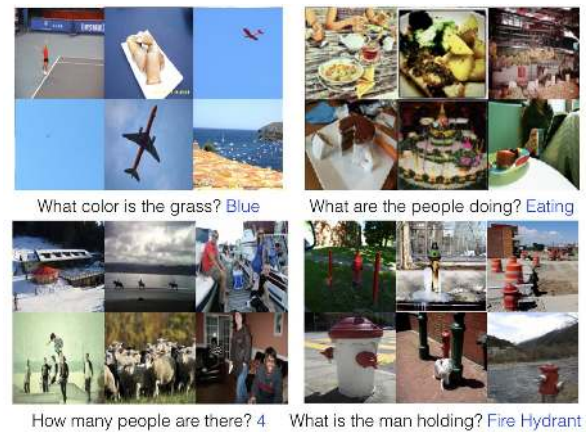
Figure 2: These montages highlight some of Vicki’s quirks. For a given question, Vicki has the same response to each image in a montage. Common visual patterns (that Vicki presumably picks up on) within each montage are evident.

lines several such quirks. For instance, Vicki has a limited capability to understand the image – when asked the color of a small object in the scene, say a soda can, it may simply respond with the most dominant color in the scene. Indeed, it may answer similarly even if no soda can is present, i.e. if the question is irrelevant.