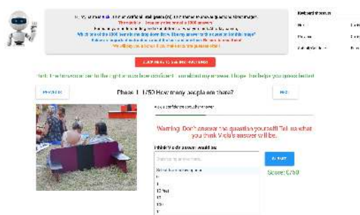
(b) The Knowledge Prediction (KP) interface.