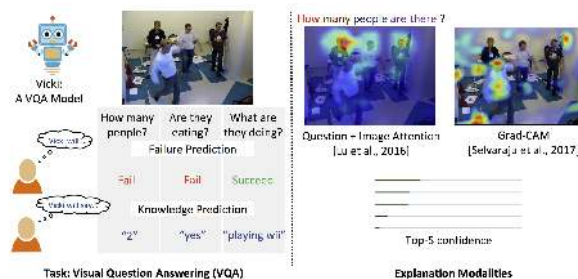
Figure 1: We evaluate the extent to which explanation modalities (right) and familiarization with a VQA model help humans predict its behavior – its responses, successes, and failures (left).

questions about images. VQA is applicable to scenarios where humans actively elicit information from visual data, and naturally lends itself to human-AI interactions. We consider two tasks that demonstrate the degree to which a human understands their AI teammate (we call Vicki) – Failure Prediction (FP) and Knowledge Prediction (KP). In FP, we ask subjects on Amazon Mechanical Turk to predict if Vicki will correctly answer a given question about an image. In KP, subjects predict Vicki’s exact response.