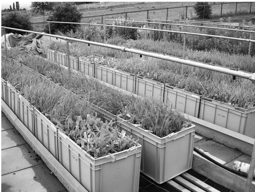
PLATE 1. Three weeks after seedling transplantation in the experimental garden at the University of Zurich, Switzerland.