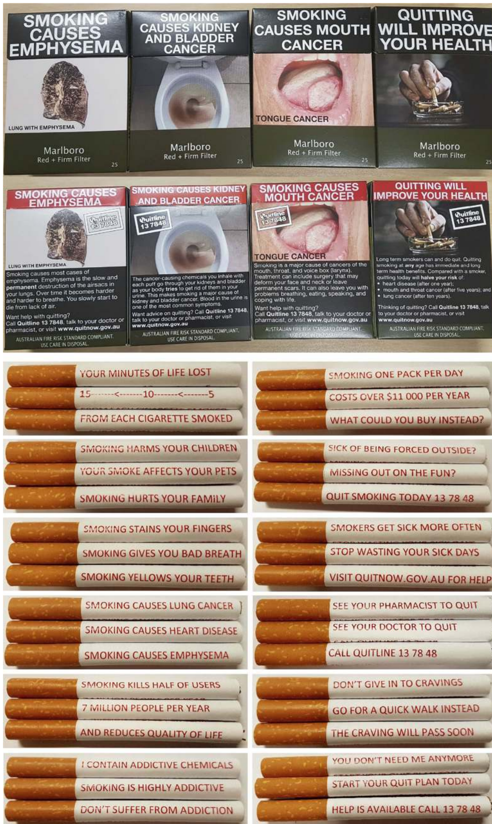
Figure 1 The current Australian cigarette packaging and twelve cigarette-stick warnings utilized in the focus groups and phone interviews.