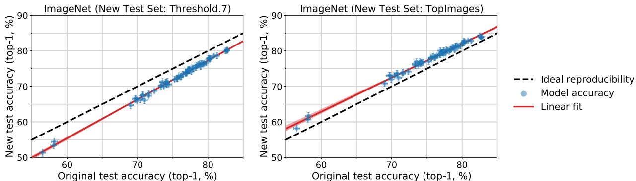
Figure 2. Model accuracy on the original ImageNet validation set vs. accuracy on two variants of our new test set. We refer the reader to Section 4 for a description of these test sets. Each data point corresponds to one model in our testbed (shown with 95% Clopper-Pearson confidence intervals). On Threshold0.7, the model accuracies are 3% lower than on the original test set. On TopImages, which contains the images most frequently selected by MTurk workers, the models perform 2% better than on the original test set. The accuracies on both datasets closely follow a linear function, similar to MatchedFrequency in Figure 1. The red shaded region is a 95% confidence region for the linear fit from 100,000 bootstrap samples.

is surprisingly hard to accurately replicate the distribution of current image classification datasets. The main difficulty likely is the subjective nature of the human annotation step. There are many parameters that can affect the quality of human labels such as the annotator population (MTurk vs. students, qualifications, location & time, etc.), the exact task format, and compensation. Moreover, there are no exact definitions for many classes in ImageNet (e.g., see Appendix D.4.8). Understanding these aspects in more detail is an important direction for designing future datasets that contain challenging images while still being labeled correctly.