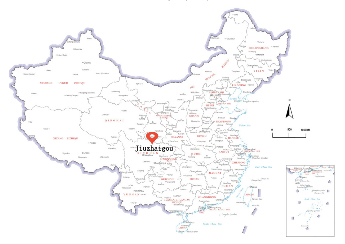
Figure 1. Location of the study area Jiuzhaigou.

Jiuzhaigou is a national nature reserve in China that was listed in the World Natural Heritage in 1992. Jiuzhaigou is located in the Aba Tibetan and Qiang Autonomous Region, Sichuan Province (Figure 1). It lies on the edge between the Qinghai-Tibetan and Yangtze tectonic plates. The area has a sub-tropical to temperate monsoon climate, with a succession of zones cooling with altitude. It is a district of narrow forested valleys and lakes beneath steep snow-capped mountains on the rugged margins of the Tibetan plateau. Jiuzhaigou is a reserve of exceptional natural beauty with spectacular jagged alpine mountains soaring above coniferous forests around a fairyland landscape of crystal clear, strange-coloured blue, green and purplish pools, lakes, waterfalls, limestone terraces, caves and other beautiful features. In addition to the spectacular scenery, Jiuzhaigou is a culturally important place filled with Buddhist shrines, prayer flags, and chorten. Despite its unique culture, Jiuzhaigou is mostly visited because of its natural scenery. The display of local culture is limited in Jiuzhaigou's scenic spots. There are several performance theaters around the entrance of the scenic spot, whereby tourists can watch dancing and acrobatics displaying local arts. Of all these performances, Jiuzhai Eternal Love has received the highest level of investment in Sichuan Province, gaining the largest capacity of the original eco-culture tourism arts show since its opening in May 2014.