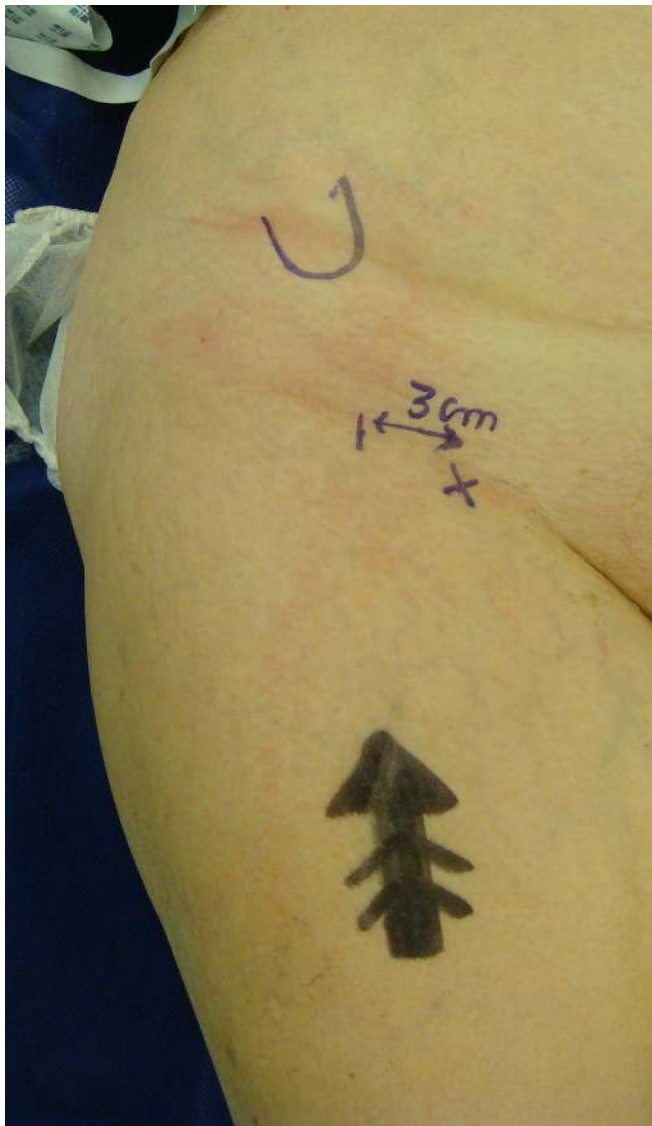
Fig. (1). Anatomical landmarks: Anterior Superior Iliac Spine and Femoral artery (X).

surgeons. The grade of the injecting surgeon (consultant or trainee), patient body mass index (BMI), success rate was recorded. The primary outcome measure of the study was success rate of the hip joint injection by the blind method, as confirmed by successful arthrogram. The secondary outcome measures were relationship between the grade of the surgeon and success rate of hip injections performed by blind method and relationship between BMI and success rate with the blind method. SPSS 17 was used for statistical analyses. Data were expressed by descriptive statistics and percentages.