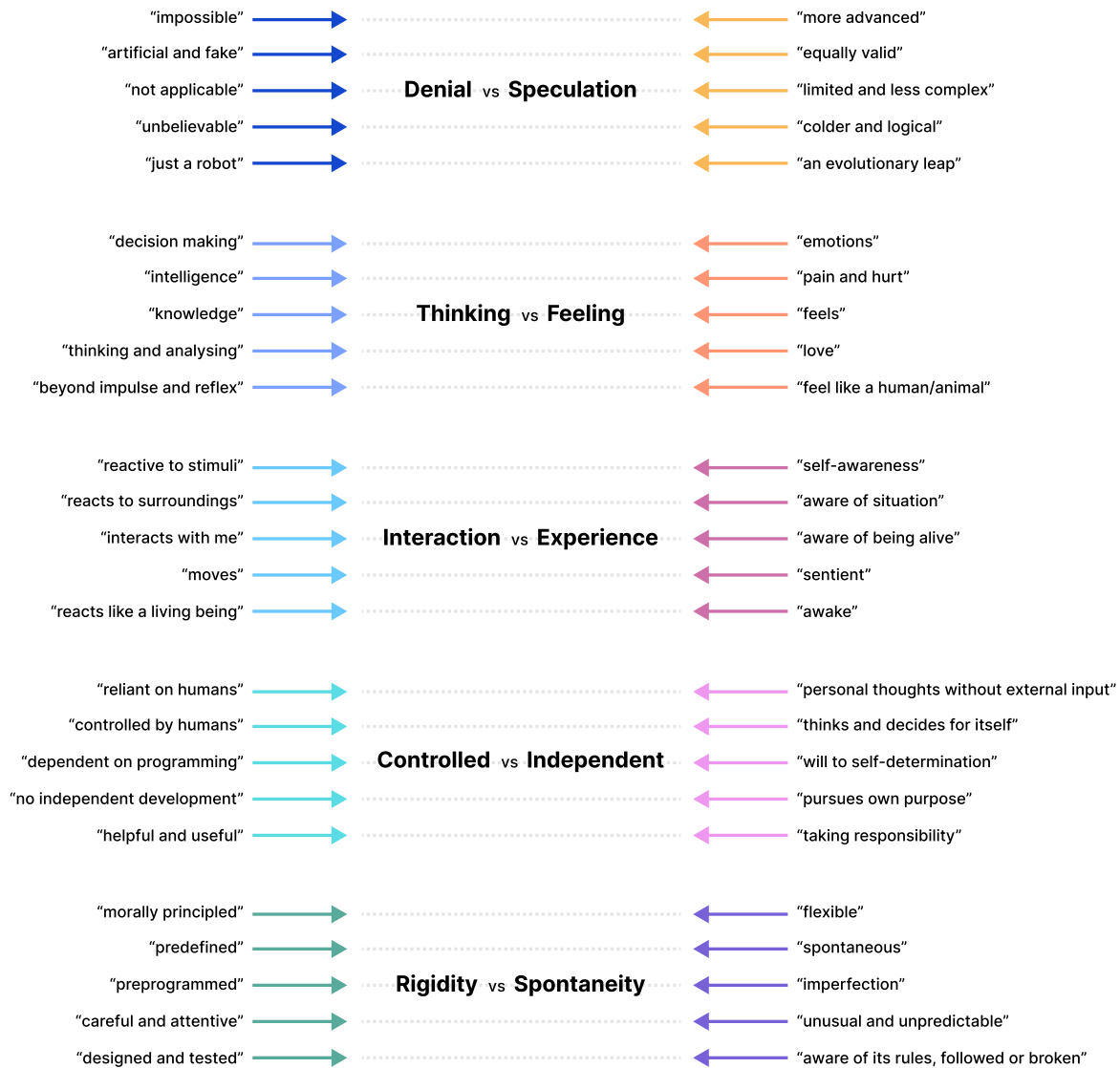
Figure 4: The five dynamic tensions are shown in their opposing categories. Key underlying concepts from the participant data characterise each category e.g. Denial summarises concepts such as “impossible”, “artificial and fake”, “not applicable”, “unbelievable”, and “just a robot”.

On the other side, some comatose patients and patients with ‘locked-in’ syndrome have subjective experience despite being unable to interact with the outside world [106]. These patients’ brain activity can be comparable to that of non-patients [107], yet they cannot physically respond to external stimuli. An analogous technological example could be a ‘conscious’ computer or GPU, that does not have the ability to display output on a screen; it may have experience but cannot express it. Hence, while the traits of experience and interactivity initially appear to be intrinsically linked, a more complex dynamic relationship hides between the two.