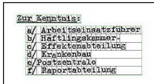
Fig. 6. Example of individual characters located and enhanced within text regions.

Having identified the position of all characters in the image, localised processing can take place for each character. This processing, aims at enhancing the characters and producing a bi-level image of each character, which will be used by OCR in the next stage.