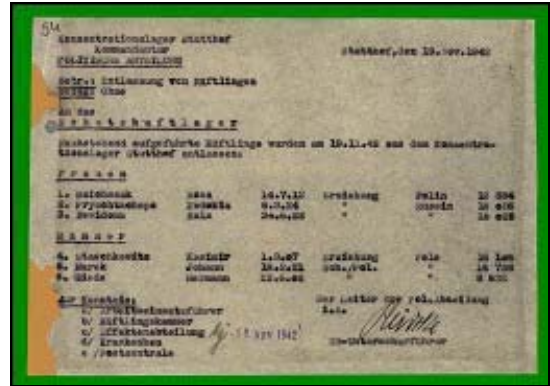
Fig. 4. The identified surrounding area (green) and the reconstructed paper areas (orange) for the document in Fig. 3.

Reconstructed paper areas are identified in the image based on information contained in the Lightness and Saturation components of the HLS data and by performing connected component analysis, careful filtering (certain regions of printed information share similar characteristics) and morphological operations. The result of the pre-processing step can be seen in Fig. 4, where the identified surrounding area is shown in green and the reconstructed paper areas in orange.