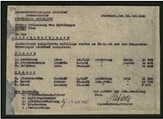
Fig. 3. A sample scanned document.

The main steps of the document image analysis stage are pre-processing , background removal , character location and character improvement . Each of these stages is described in the remainder of this section.