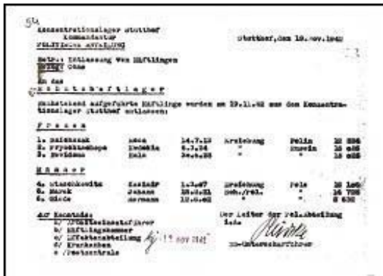
Fig. 5. The document in Fig. 3 with all non-foreground elements removed (white).

more refined processing). The result of the background removal process can be seen in Fig. 5.