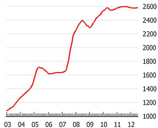
Fig. 3. Second-hand House Price Index, Shanghai (2003 = 1000)

is based on accounting profit (a poor proxy for economic profit), is distorted by inflation. In particular, he demonstrated that under inflation, for a firm holding non-depreciable fixed assets with a project duration of, say, four years, the EVA of the firm is understated. De Villiers (1997) derived the adjusted EVA (AEVA), which provides a better estimate of actual profitability under inflation, as an alternative performance measurement tool for companies.