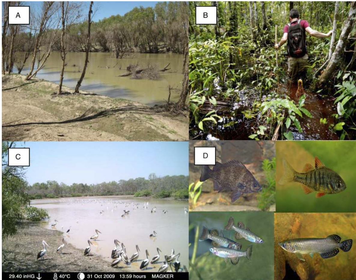
FIG. 3. (A) Defoliated and damaged vegetation along the arrhythmic Flinders River, Australia after recession of an extended flood in the Austral summer of 2009. Floods of similar duration that occur annually in the Amazon lead to high productivity because of local adaptations of tree species to submergence and anoxia. (B) The floodplain of the Napo River, an Amazonian tributary in Ecuador, often has waters rich in dissolved organic carbon. (C) Pelicans in a floodplain waterhole of the Mitchell River, Australia. Highly variable avian populations occur commonly in arrhythmic rivers. (D) Some of the fish species that are common in the most rhythmic Australian rivers (clockwise from top left: lake grunter Variichthys lacustris , pennyfish Denariusa bandata , saratoga Scleropages jardinii , delicate blue eye Pseudomugil tenellus.

disturbances, such as rhythmic floods, would allow a larger suite of organisms to maintain viable populations via storage effects, or to persist during unfavorable conditions (Chesson et al. 2004). Hence, though rhythmic rivers could be described as harsh, fluctuating environments, their relatively predictable fluctuations may promote more diverse and productive communities (Chesson and Huntly 1997). Under stochastic disturbance or non-stationarity (e.g., a new flow regime introduced by a dam), local extinctions are, instead, hastened by competitive exclusion or random drift (Chesson and Huntly 1997). Many arrhythmic rivers experience occasional periods of drought and no flow which represents a second type of disturbance. Harsh drought conditions reduce critical resources and populations of aquatic organisms, but are eventually followed by rapid population growth when flows are reestablished