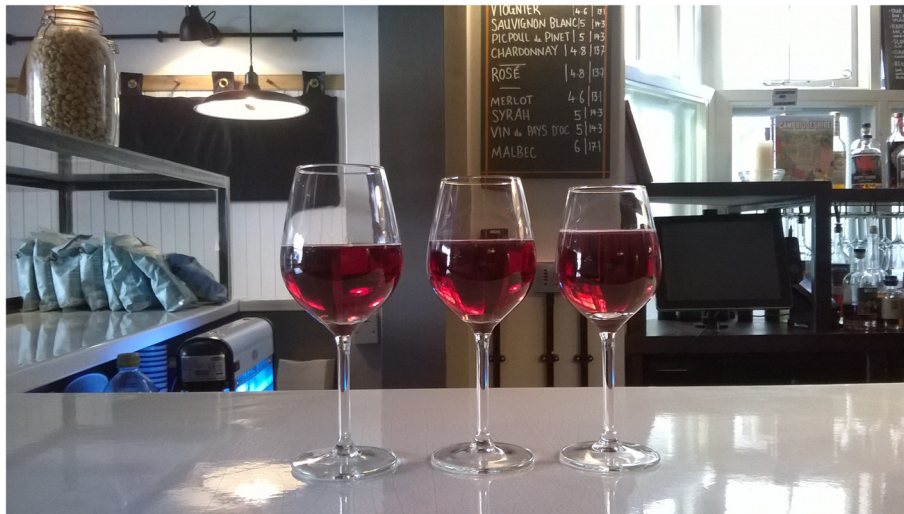
Fig. 1 Design of glasses used in the study (filled to 175 ml)

excluding wine were logged in the analyses. Due to heteroscedasticity, both the mean and variance of sales (see Table 2) were included in models (using identity and log links respectively).