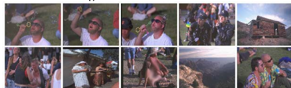
Fig. 2c Visual result of DCSD 8, NMRR = 0.0000, 3 of 3 ground truth images found in the first 10 retrievals.