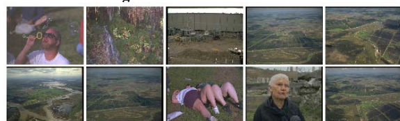
Fig. 2d Visual result of DCD QHDM, NMRR = 0.6410, 1 of 3 ground truth images found in the first 10 retrievals.