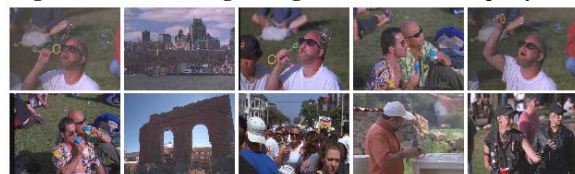
Fig. 2b Visual result of DCSD 5, NMRR = 0.0769, 3 of 3 ground truth images found in the first 10 retrievals.