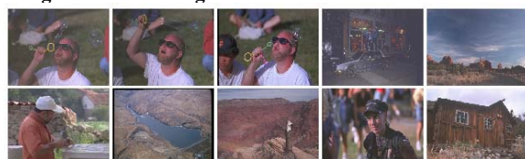
Fig. 2e Visual result of CSD 32, NMRR = 0.0000, 3 of 3 ground truth images found in the first 10 retrievals.