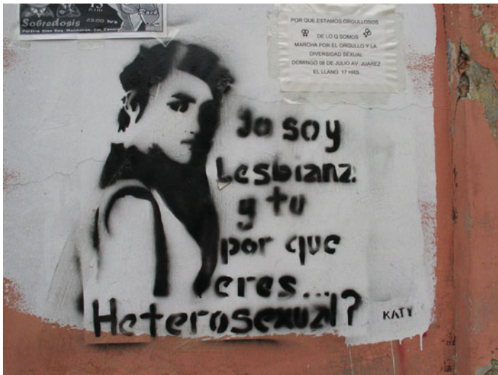
FIGURE 12 A 2008 stencil in Oaxaca.