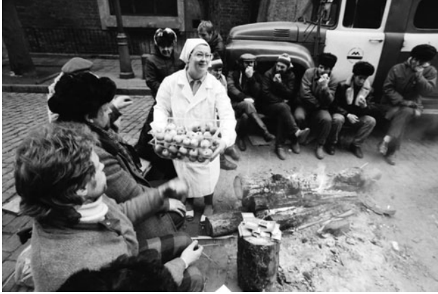
FIGURE 4 Barricade sociality in Riga, 1991.

distrusted agents of the russifying Soviet state rather than fellow citizens struggling for freedom and democracy, while for many Russian-speakers living in the Soviet Socialist Republic of Latvia, Latvians were reactionary nationalist elements. The barricades disrupted, if momentarily, this internal frontier produced partly by Soviet governing practices and partly by the political imaginaries of the national independence movement. This was not an absolute disruption insofar as some Russian-speakers, but also some Latvians, had joined the International Front—a political organization consisting of supporters