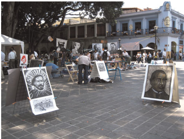
FIGURE 7 APPO take over of the zócalo in 2008. Here Mexican revolutionary Pancho Villa, indigenous President Benito Juárez, Karl Marx, Friedrich Engels, Vladimir Lenin, Joseph Stalin, and Oaxacans work to find common ground.