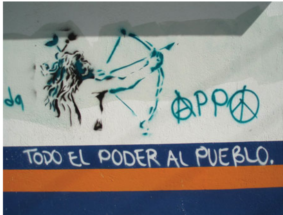
FIGURE 8 ASARO stencils, 2007.

Rancière calls “the distribution of the sensible” (2004). For Rancière, aesthetics has a political function insofar as it opens up or disrupts the bounded self and social community and exposes these as political and social constructions; in rendering visible the constructed nature of the grid of intelligibility that forms the social terrain organizing society, political street art puts into question this distribution of the sensible and opens up a space with possibilities for imagining, mapping, and acting out different political practices and political