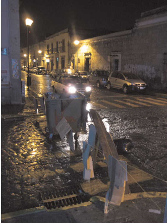
FIGURE 1 A barricaded street in Oaxaca, 2008.