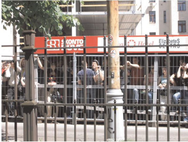
FIGURE 3 Fences Surrounding Pride in Riga, 2007.

forces, or KGB agents? Helicopters were flying above our heads on the riverside. In the Dome Square, people were quietly handing out small red-white-red flags; suspicious-looking men were taking photographs. On 22 July 2006 in Riga I felt similar to how I felt during the times of the People's Front. How many years did we have to live in a free and democratic state to come to the conclusion that this society is very far from truly understanding democracy? 7