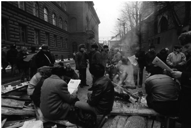
FIGURE 5 Barricade sociality in Riga, 1991.

distrusted agents of the russifying Soviet state rather than fellow citizens struggling for freedom and democracy, while for many Russian-speakers living in the Soviet Socialist Republic of Latvia, Latvians were reactionary nationalist elements. The barricades disrupted, if momentarily, this internal frontier produced partly by Soviet governing practices and partly by the political imaginaries of the national independence movement. This was not an absolute disruption insofar as some Russian-speakers, but also some Latvians, had joined the International Front—a political organization consisting of supporters