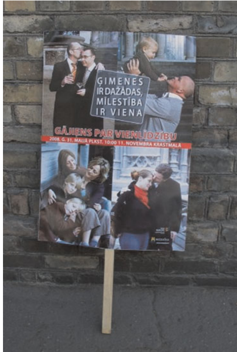
FIGURE 11 A 2008 Pride Poster in Riga.