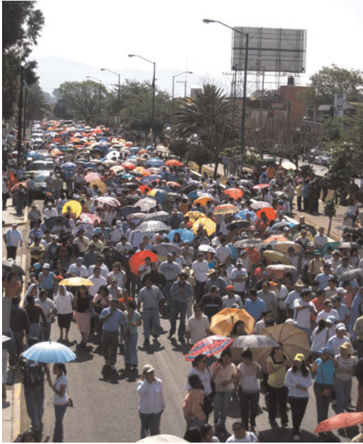
FIGURE 6 APPO Mega-march.