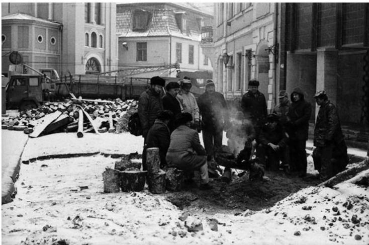
FIGURE 2 A barricaded street in Riga, 1991.