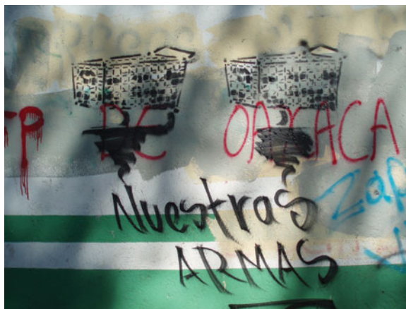
FIGURE 9 ASARO stencils, 2007.

Rancière calls “the distribution of the sensible” (2004). For Rancière, aesthetics has a political function insofar as it opens up or disrupts the bounded self and social community and exposes these as political and social constructions; in rendering visible the constructed nature of the grid of intelligibility that forms the social terrain organizing society, political street art puts into question this distribution of the sensible and opens up a space with possibilities for imagining, mapping, and acting out different political practices and political