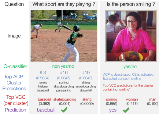
Figure 4: Qualitative examples from GVQA. Left: We show top three answer cluster predictions (along with random concepts from each cluster) by ACP. Corresponding to each cluster predicted by ACP, we show the top visual concept predicted by VCC. Given these ACP and VCC predictions, the Answer Predictor (AP) predicts the correct answer ‘baseball’. Right: Smiling is the concept extracted by the CE whose visual presence in VCC’s predictions is verified by the Visual Verifier, resulting in ‘yes’ as the final answer.

GVQA is a first step towards building models which are visually grounded by design. Future work involves develop-