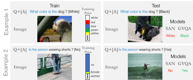
Figure 1: Existing VQA models, such as SAN [38], tend to largely rely on strong language priors in train sets, such as, the prior answer ('white', 'no') given the question type ('what color is the', 'is the person'). Hence, they suffer significant performance degradation on test image-question pairs whose answers ('black', 'yes') are not amongst the majority answers in train. We propose a novel model (GVQA), built off of SAN that explicitly grounds visual concepts in images, and consequently significantly outperforms SAN in a setting with mismatched priors between train and test.

Automatically answering questions about visual content is considered to be one of the highest goals of artificial intelligence. Visual Question Answering (VQA) poses a rich set of challenges spanning various domains such as computer vision, natural language processing, knowledge representation, and reasoning. In the last few years, VQA