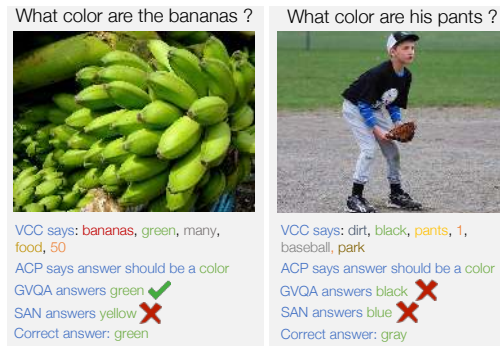
Figure 5: Left: GVQA’s prediction (‘green’) can be explained as follows – ACP predicts that the answer should be a color . Of the various visual concepts predicted by VCC, the only concept that is about color is green . Hence, GVQA’s output is ‘green’. SAN incorrectly predicts ‘yellow’. SAN’s architecture doesn’t facilitate producing an explanation of why it predicted what it predicted, unlike GVQA. Right: Both GVQA and SAN incorrectly answer the question. GVQA is incorrect perhaps because VCC predicts ‘black’, instead of ‘gray’. In order to dig further into why VCC’s prediction is incorrect, we can look at the attention map (in the supp.), which shows that the attention is on the pants for the right leg, but on the socks (black in color) for the left leg. So, perhaps, VCC’s “black” prediction is based on the attention on the left leg.

ing models that can utilize the best of both worlds (visual grounding and priors), such as, answering a question based on the knowledge about the priors of the world (sky is usually blue, grass is usually green) when the model’s confidence in the answer predicted as result of visual grounding is low.