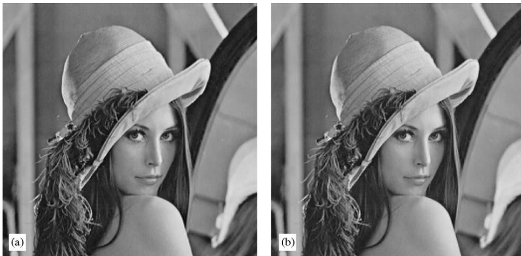
Fig. 1. Reconstructed Lena image with wavelet-based downsampling and (a) wavelet-based upsampling (35.25 dB), (b) DCT-based upsampling (30.19 dB).

The PSNR results are important in applications where the image is further subjected to some processing or if it is used for differential coding. For human observers, the visual image quality is important. Fig. 1 shows a comparison between the reconstructed Lena images. The downsampling method is the same (wavelet-based), and the difference is in the upsampling: wavelet-based versus DCT-based. Even though wavelet-based