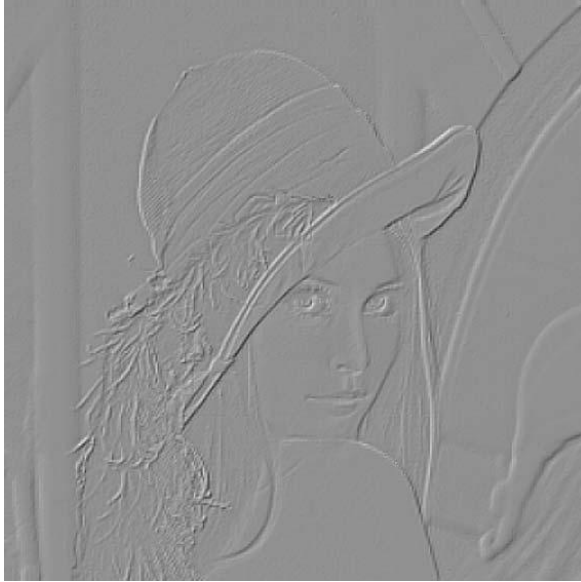
Fig. 2. The rescaled difference of images Fig. 1 (a) and (b). Medium gray levels indicate where the two are identical. The differences are the dark and bright colored areas.

upsampling results in an image that is 5.06 dB better than the DCT-based image, the differences are visually very small.