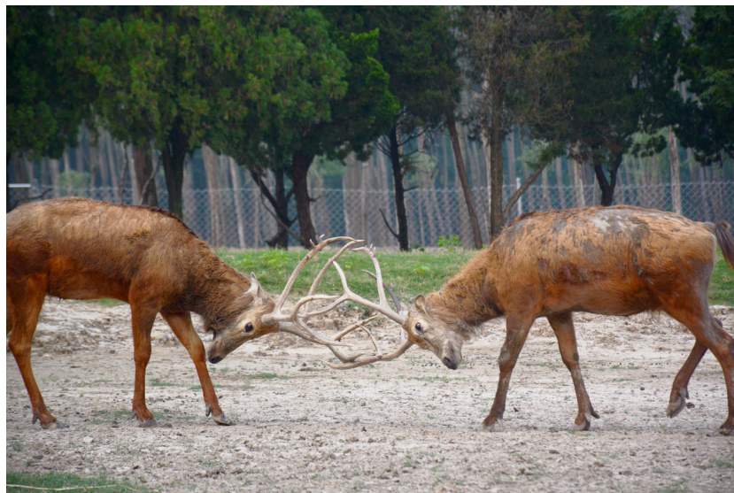
Figure 1: Photo of 2 fighting Père David's deer in Dafeng Milu National Reserves, Jiangsu, China. A red wound was spotted on the body of the deer to the right, and winning such fights generally increases mating chances.

that milu is closer to the genus Cervus [5–9]. However, little is known about the genetic architecture underlying milu's unique phenotypic features and the population dynamics during its recovery from the severe bottleneck. Thus, we constructed a draft genome for the species to facilitate investigation of effects of the severe recent bottleneck and the molecular mechanisms involved in its phenotypic evolution.