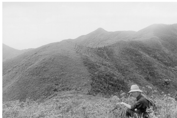
Plate 1 A westerly view of the core area of Yihuang South China Tiger Reserve.

Despite the reputed abundance of sightings and putative tiger traces reported, none could be confirmed and we failed to find any compelling evidence to indicate that