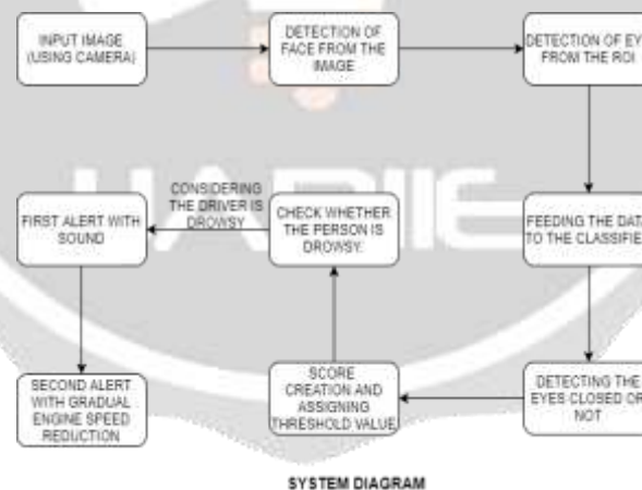
Fig- 1: System diagram

An alert system plays a crucial role here. Once the score crosses the threshold value, the alert begins from the system. There exist two types of alert, first one is just an alert by using sound and second one, providing continuous sound and engine speed reduction. The system diagram for the experimentation with the processes involved are mentioned in Fig-1.