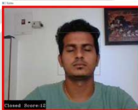
Fig -3: Eyes Closed (Score: 12) First level of alertness