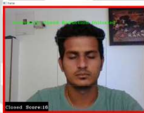
Fig -4: Eyes Closed (Score: 16) Gradual Speed Reduction enabled.