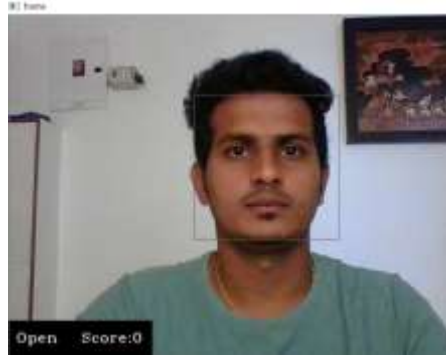
Fig -2 :Eyes open (Score : 0)