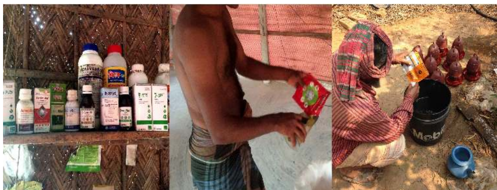
FIGURE 1 | Application of antibiotics in poultry feed and drinking water.