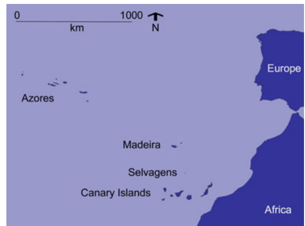
Figure 1 Location of the Macaronesian archipelagos considered in this study.

Volcanic in origin, the Macaronesian islands (excluding the Cape Verde archipelago) are situated in the North Atlantic