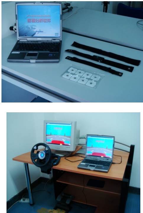
Fig. 1. The KF2 dynamic multi-parametric physiological detector and driving simulator

The driving simulator consisted of two parts: first, simulated car operation device including control stick, accelerator and brake pedal. Second, driving behavior surveillance system based on computer consisted of driving task presentation, recording of driver's reaction, data management, feedback of driving state and alarming modules. ECG signal was recorded by KF2 dynamic multi-parametric physiological detector. This kind of wireless wearable physiological detector can record multiple physiological indices include ECG with 3 leads, respiration and body temperature. The data can be analyzed by a data processing software. Figure 1 shows the physiological detector and the driving simulator.