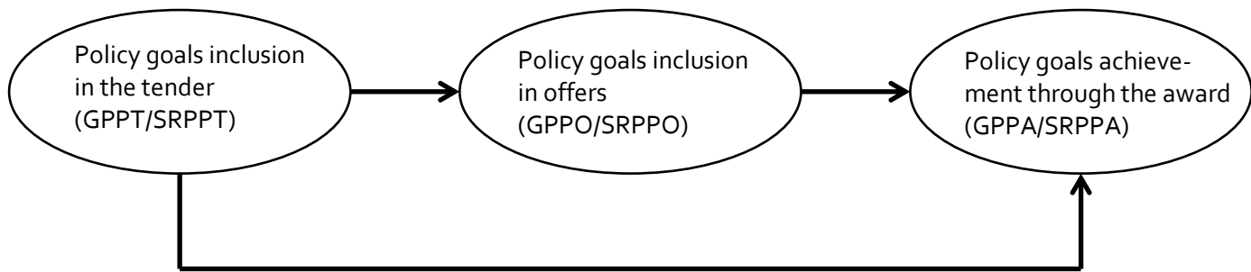
Figure 1 Initial conceptual framework