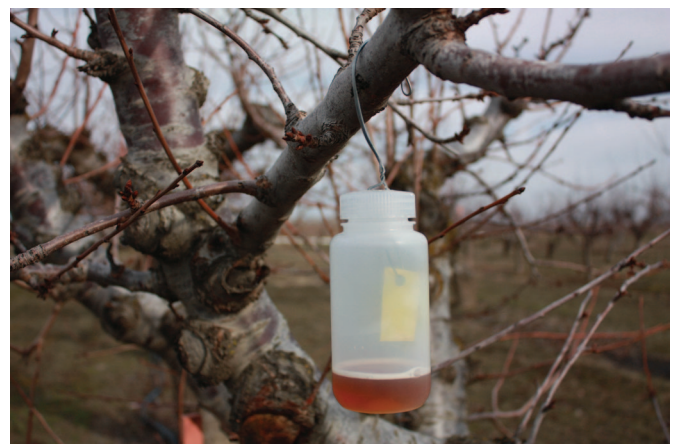
Fig. 7. Drosophila suzukii trap deployed in a cherry orchard.

Biological Control. Parasitoid wasps (Braconidae and Cynipidae) are thought to be the primary Hymenopteran families targeting Drosophila spp. and have potential as biocontrol agents against D. suzukii