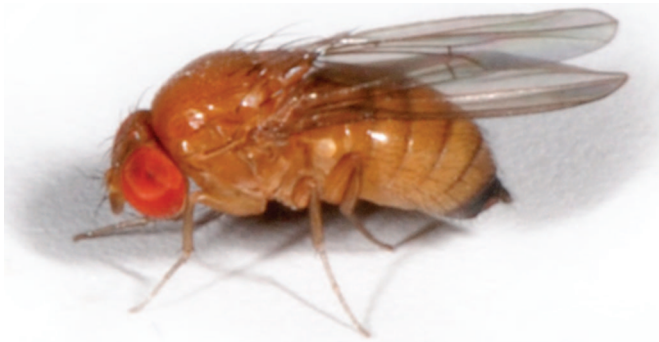
Fig. 1. Adult female Drosophila suzukii .