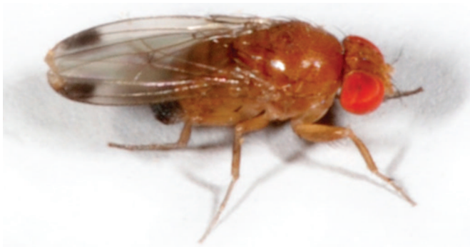
Fig. 2. Adult male; note dark spots on wing tips.

They have black stripes on the abdomen and males have a distinguishing dark spot on the leading edge near the tip of each wing. The spot may play a role in courtship but results are ambiguous for flies under diurnal light cycles (Fuyuma 1979). The female's serrated ovipositor (Fig. 3) is able to penetrate the skin of most thin-skinned fruit, leaving a small depression, scar, or "sting" on the fruit's surface (Fig. 4). A female lays \approx 1 –3 eggs per oviposition site, averaging 380 eggs in her lifetime. The number of eggs laid may depend on fruit maturity and eggs tend to be randomly distributed on cherry fruit (Mitsui et al. 2006). Multiple clutches of larvae are quite possible on