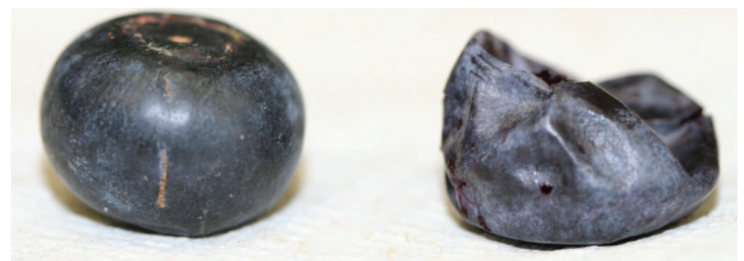
Fig. 5. Infested blueberry (right) exhibits soft, sunken areas two weeks after exposure to D. suzukii when compared with control blueberry (left).

Kanzawa observed that the fly oviposited most often on cherries, peaches, plums, persimmons, strawberries, and grapes in Japan, but