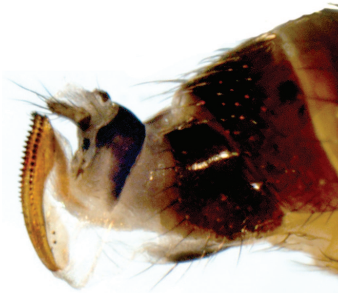
Fig. 3. Serrated ovipositor of D. suzukii .

They have black stripes on the abdomen and males have a distinguishing dark spot on the leading edge near the tip of each wing. The spot may play a role in courtship but results are ambiguous for flies under diurnal light cycles (Fuyuma 1979). The female's serrated ovipositor (Fig. 3) is able to penetrate the skin of most thin-skinned fruit, leaving a small depression, scar, or "sting" on the fruit's surface (Fig. 4). A female lays \approx 1 –3 eggs per oviposition site, averaging 380 eggs in her lifetime. The number of eggs laid may depend on fruit maturity and eggs tend to be randomly distributed on cherry fruit (Mitsui et al. 2006). Multiple clutches of larvae are quite possible on