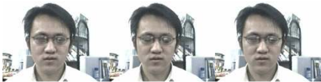
Figure 3. JZU database sample for closed eye (Video: 000001M_FBN.avi, Frames: 35, 39 and 42) All frames between the 35 th and 42 nd frames are labeled as closed eye frame since both eyes are at least 80% closed.

In literature, the PERCLOS (PERcentage of eye CLOSure) [11] value has been used as drowsiness metric which shows the percentage of time in a minute that the eyes are 80% closed. In addition, we manually marked the frames that eyes are at least 80% closed as seen in Figure 3.