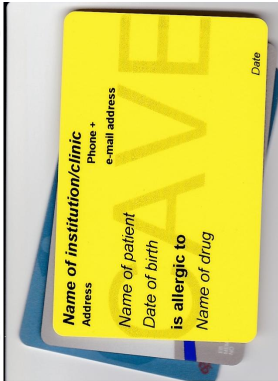
Figure 3. Example of a drug allergy alert card