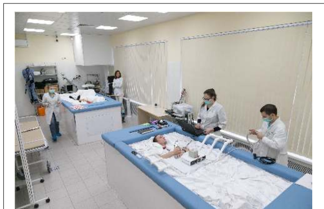
FIGURE 1 | Overall view of dry immersion facilities at IBMP.

In the 1970s the water immersion was used broadly as a fast and convenient model for assessing the efficacy of countermeasure means and methods. Those studies were