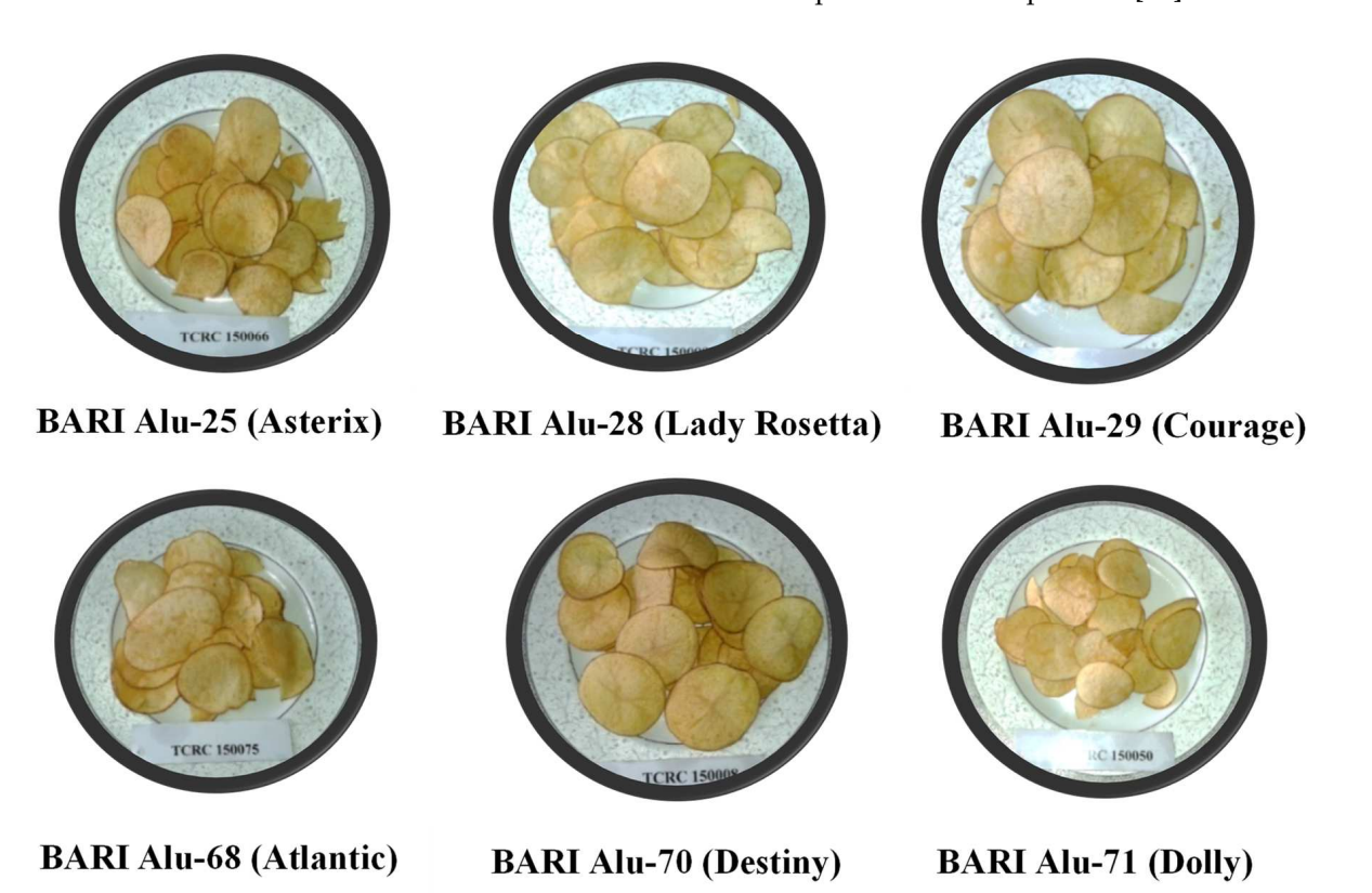
Figure 2. Chips color of various processing varieties.

which were very close in scoring to BARI Alu-28 (Lady Rosetta). BARI Alu-28 (Lady Rosetta) obtained the highest score in taste (8.97), aroma (7.47) and overall acceptability (8.40) which was very close to BARI Alu-29 (Courage) (Table 5). The most essential sensory elements on which customers base their evaluation of potato chips are flavor, aroma, color, and texture [44]. Aroma is an important quality of a product and some authors from the previous studies reported that consumers did not appear willing to negotiate on a product's flavor, regardless of its health advantages or other good consequences. [45]. Besides this, the taste is also controlled consumer acceptance of a food product [46].