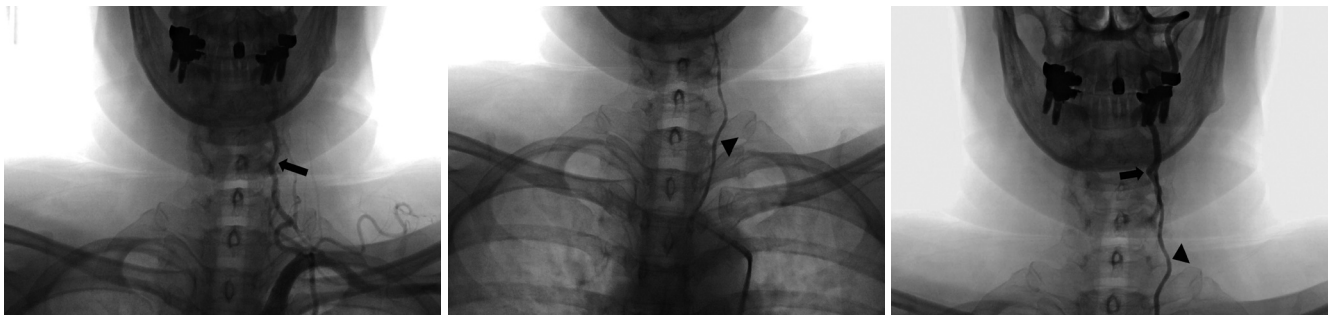
Fig. 2. Duplication of the left vertebral artery origin in a 51-year-old female patient. A. Left subclavian angiographic image shows the normal limb of the duplicated left vertebral artery (arrow) arising from the left subclavian artery. B, C. Selective angiography of the anomalous hypoplastic limb (arrowhead) shows it is the third branch of the aortic arch, and opacifies the left vertebral artery as a result of the retrograde flow into the normal limb (arrow).