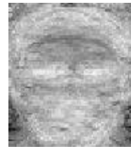
Figure 3 Inter to intra class ratios of DWT coefficients

The purpose of DWT coefficient selection is to select the most discriminative DWT coefficients. This proceeds by wavelet transforming each training image and extracting the low-pass coefficients to form the image’s observation vector. The inter-class and intra-class standard deviations for each coefficient are calculated and the ratio of these values is determined. This ratio indicates how tightly the coefficient’s values are clustered within a class compared to the spread within the complete training dataset. The coefficients with the highest ratios are deemed to be the most discriminative and are used for recognition. Figure 3 illustrates the ratios visually. The brighter areas in the image represent DWT coefficients with higher inter-class to intra-class ratios.