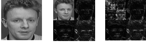
Figure 1a. Face image from AT&T Database of Faces