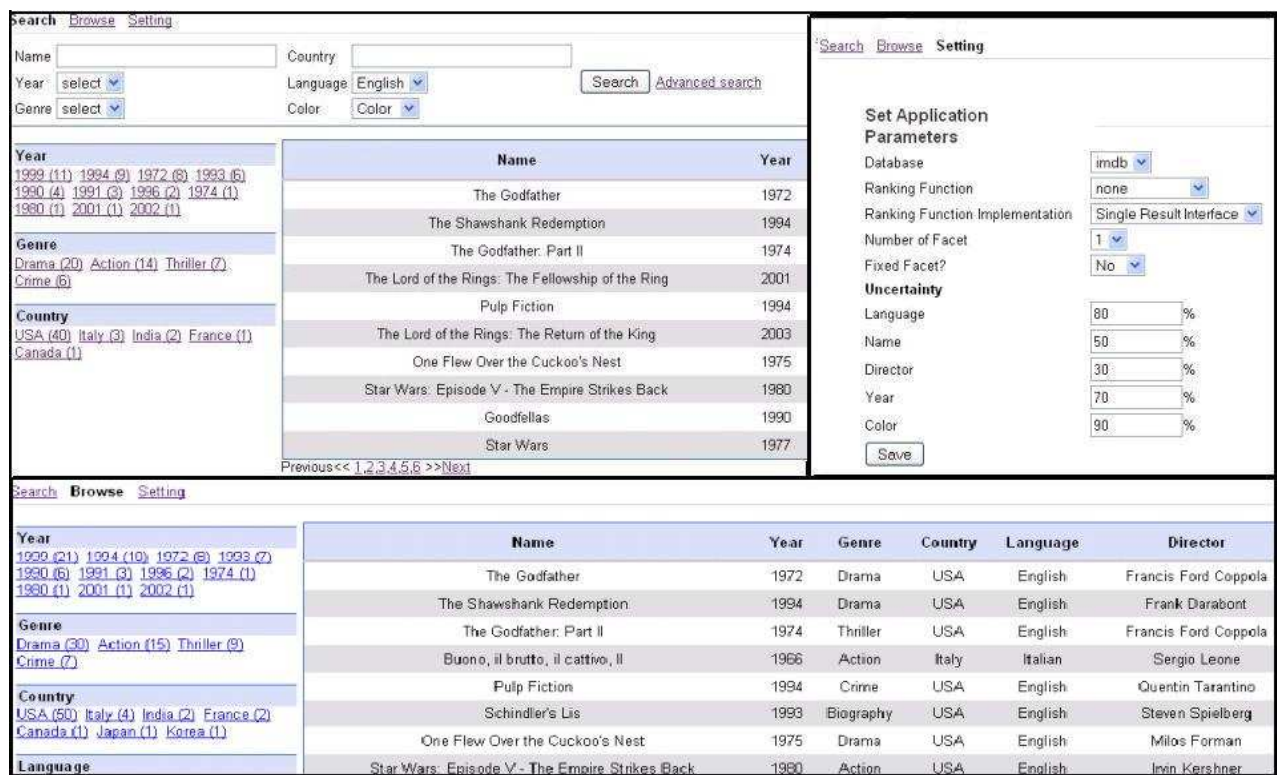
Fig. 3. Screen shot of DynaCet GUI

local copy of IMDB database (nearly 20 attributes) and Yahoo Auto dataset (more than 40 attributes) can be queried by the user. The upper right half of Figure 3 shows the parameter setting interface of DynaCet through which users will be able to provide their choices. In general, the demonstration will focus upon two broad aspects of search - Browse Only and Search and Browse .