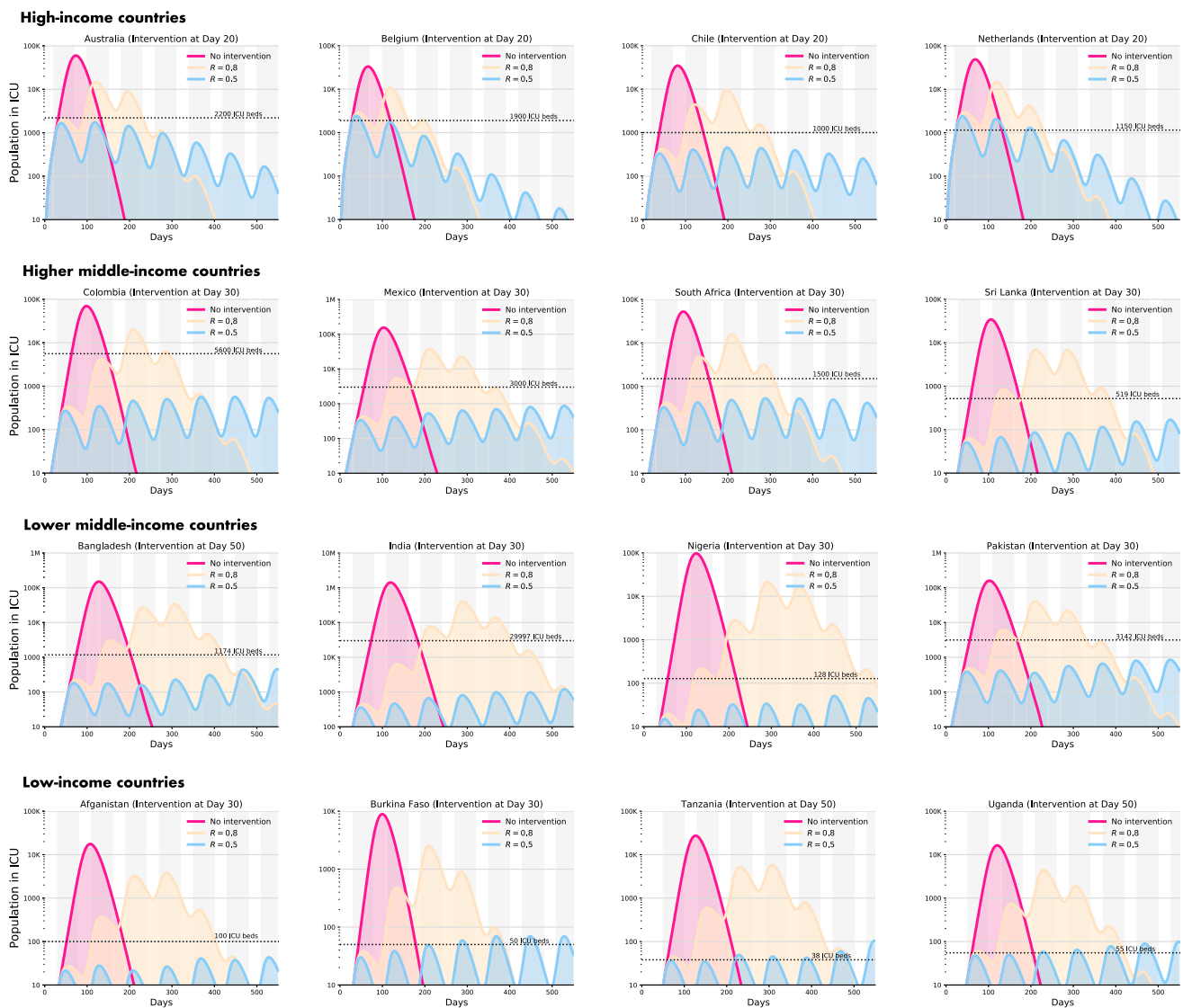
Fig. 1 Impact of dynamic interventions and relaxation on ICU beds requirement in 16 countries over an 18-month period

the end of each cycle of suppression and relaxation, such approach would result in a longer pandemic, beyond 18 months in all countries; however, global mortality would drop to 131,643 during that period (Fig. 1).