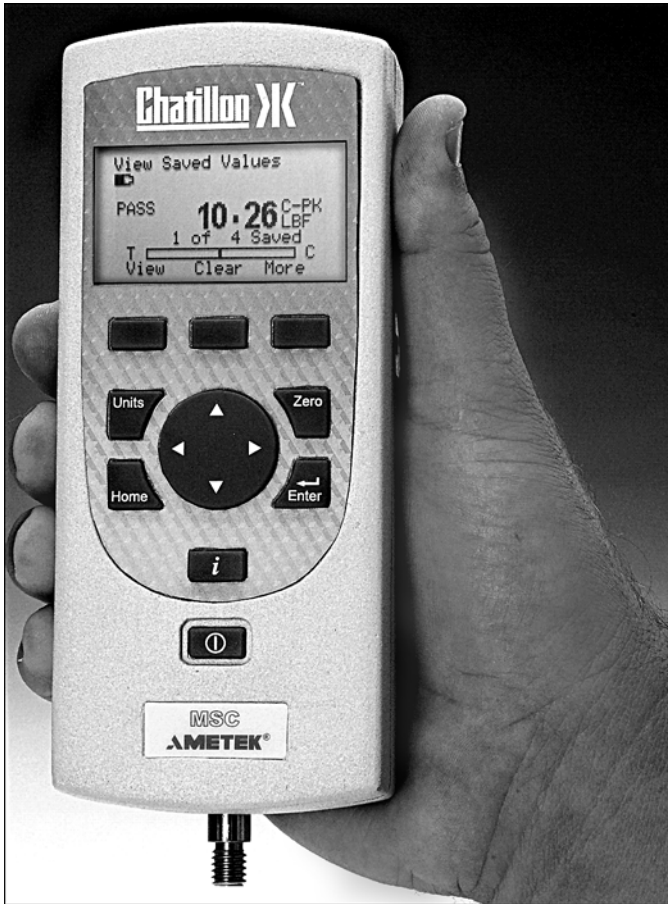
Figure 1. Chatillon® MSC Series dynamometer (AMETEK, Inc, Largo, Florida). Used to test muscle strength and has “U”-shaped attachment (not shown) that provides comfortable contour when significant pressure is applied to limb segment. Figure courtesy of AMETEK, Inc.

has a 1 kg minimum threshold. It disregards the first second of data because force output rapidly increases in the initial period [23]. The sampling rate is adjustable so that the number of samples is optimized depending on the speed of contraction.