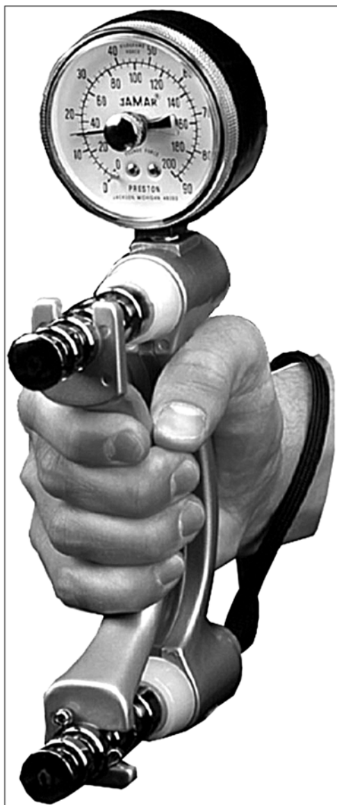
Figure 5. Jamar ® Hydraulic Hand Dynamometer (Model J00105) (Sammons Preston, Bolingbrook, Illinois) has isometric design to ensure accurate, reproducible results and shock-resistant rubber cap that protects stainless-steel gauge. Wrist strap prevents accidental damage if dropped.

handle can be placed in five grip positions, from 1.375–3.375 in., in 0.5 in. increments. This sealed hydraulic system features a dual-scale readout that displays isometric grip force from 0–200 lb (90 kg). The Jamar dynamometer is the most widely used instrument for measuring grip strength, and many test protocols have been developed because of its widespread use [19].