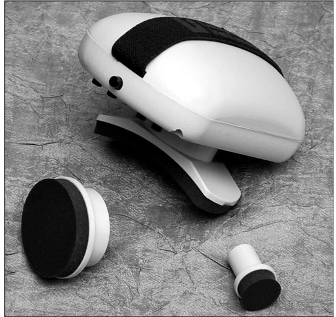
Figure 2. Lafayette Manual Muscle Test System™ (Model 01163) (Lafayette Instrument Company, Lafayette, Indiana). Lafayette Manual Muscle Test System provides comfortable grip against which counterresistance is provided. Curved attachment provides best comfort on contoured surface. Other attachments provide more directed force for smaller surface areas. Figure courtesy of Lafayette Instrument Company.

The Chatillon MSC Series dynamometer measurement accuracy is >0.1 percent full scale; a liquid-crystal display supports a variety of measurements, including normal and peak readings, dominant versus nondominant comparisons, pass-fail results, statistical results, load averaging, load comparisons, measurement actuation, and direction. The display can be inverted, and displayed results may be hidden from the subject during testing. This device collects a continuous analog signal that can be downloaded to a computer or viewed on the digital screen.