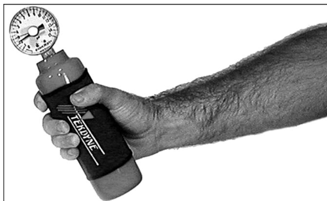
Figure 6. Tekdyne Hand Dynamometer (Tekdyne, Corp, North Wales, Pennsylvania) measures peak strength through comfortable compression resistance with visible gauge to enable easy reading by examiner and provide feedback to subject.

The Lafayette Hand Dynamometer features a dual-pointer system to retain the maximum effort and 4 cm of infinite handle adjustment for a comfortable fit ( Figure 8 ). Also, during a grip test, the spring compresses, which provides the handle with realistic dynamic motion. The testing range on a dual scale is 0–100 kg to the nearest 0.2 kg. The unit contains a custom-twisted spring that can