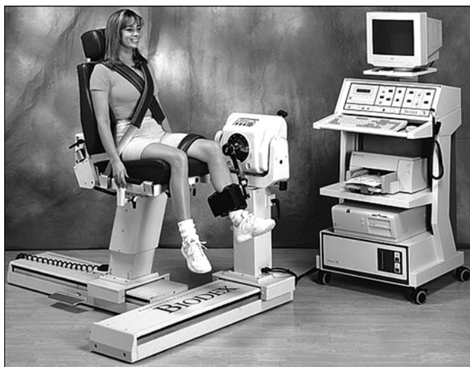
Figure 9. Biodex System 3™ (Biodex Medical Systems, Inc, Shirley, New York) enables measurement of strength (torque output) throughout range of motion for many muscle groups (shoulder, elbow, and forearm [quadriceps testing shown here]) for concentric and eccentric contractions. Modes for passive range of motion, isometric, and isotonic are available settings. Protections from impact during accelerations/decelerations are provided. Figure courtesy of Biodex Medical Systems, Inc.

While testing positions are standardized, some testing positions for persons with SCI are cumbersome. Shoulder flexion and abduction strength tests are difficult because the fixed axis becomes misaligned with the changing axis of rotation of the glenohumeral joint. For example, Noreau and Vachon tested shoulder abduction/adduction