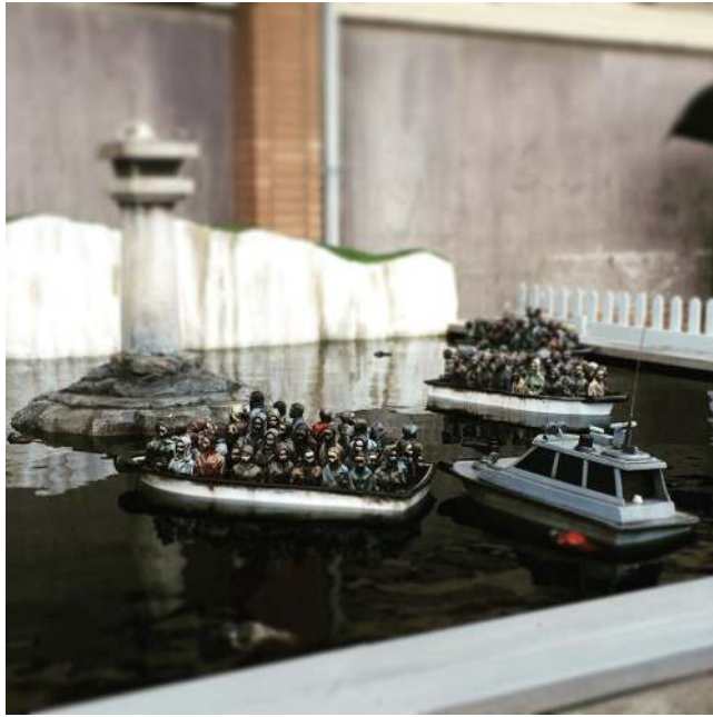
Figure 1. Mediterranean Boat Ride . Photo by Florent Darrault, 23 August 2015, under the Creative Commons Attribution-Share Alike 2.0 Generic license. No changes were made.

as with various photos of demoralised Mickey Mouse-eared employees. The latter provide the perspective of underpaid female and/or ethnic workers who are usually behind the façade of Disney's show of happiness. Perhaps the queuing public did not feel that there was that much food for thought after all, as the readings were too easily graspable. The theme of security (or lack of it in a world where the alarming signs of terrorism are prevalent) is already present at the entrance with fake metal detectors and check points; the full-blown Disney castle on a lake displays a warped Ariel (a technique also used by Cawston for the poster of his exhibition though applied to a staff member on her/his break wearing the infamous Mickey Mouse ears); human excrement floats in the water; a boat with plastic refugees is adrift; police hoses stands for a fountain; a Ferris wheel is also there; a killer-whale jumping through a hoop into a toilet starkly reminds us that Willy was never freed.