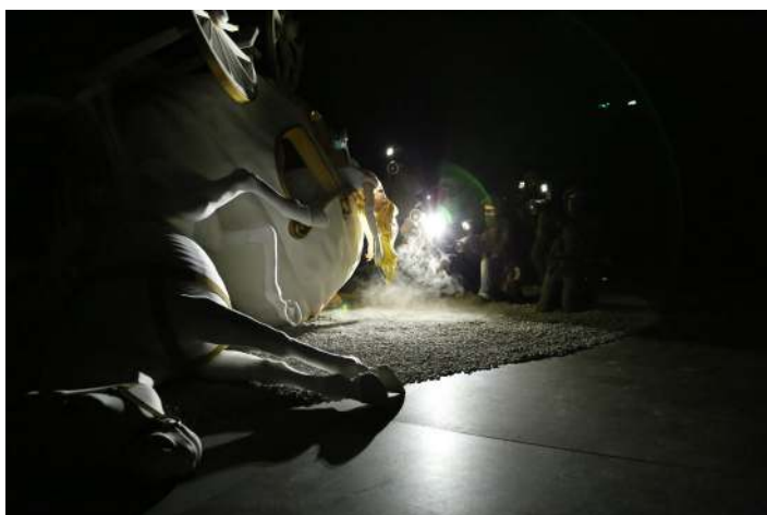
Figure 2. Cinderella's coach crash.