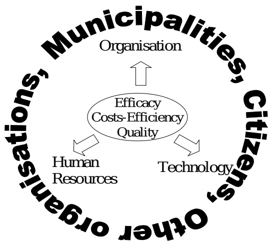
Figure II: The SUMA Model.