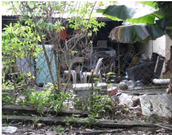
Figure 2. Dumping of E-waste at the backyard of an electrical repair shop.

According to the interviews and discussions with some staff working in local authority government and institutes, in some management options, they declared that mostly the systems, in which they are practicing by backing system or pay backing. The statistical findings revealed that there was a noticeable difference between frequencies of these groups ( \chi^2 = 6.533 , p < 0.011 ). Consequently, it can be concluded that the majority of shopping managers have no information about E-Waste. Which figure 2 and 3 as well showed the illegal dumping of those kind of waste.