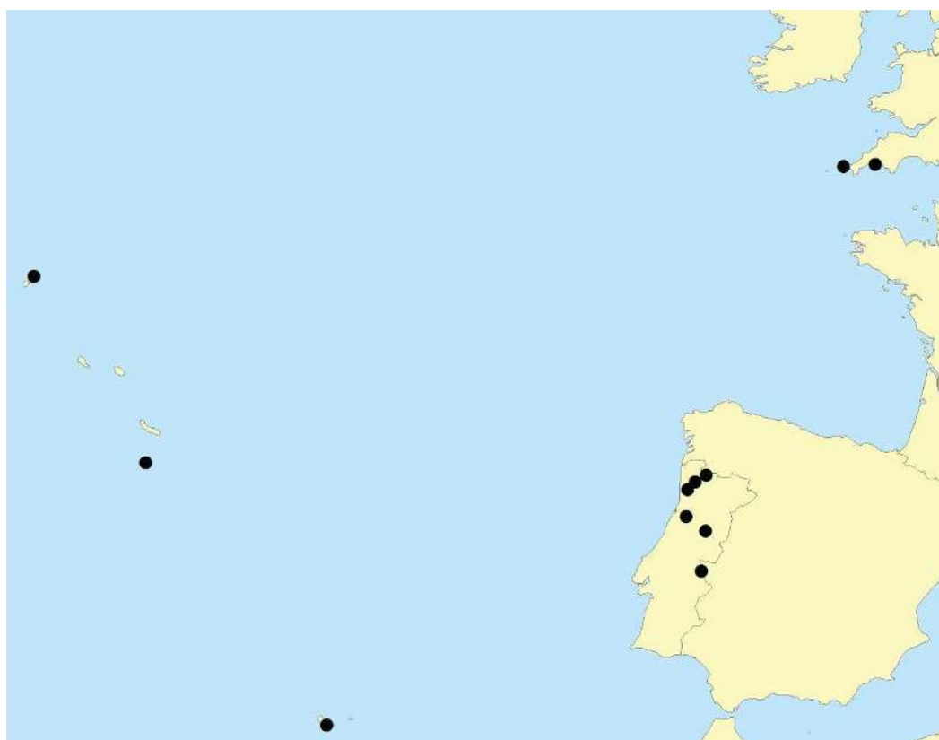
FIGURE 5. World distribution of Marsupella profunda .

Marsupella profunda has a special status. It occurs only in Britain, Portugal, Madeira and the Azores (Fig. 5) and is listed as a priority species on EU's Habitat Directive (Porley et al. , in press). In Britain it is fully protected and grows as a pioneer species on China Clay waste. However, since the China Clay extraction has ceased very little new habitat spots are opened up and the habitat is disappearing. Therefore, an action plan to secure its long term survival is needed where artificial disturbance is a part of the conservation action.