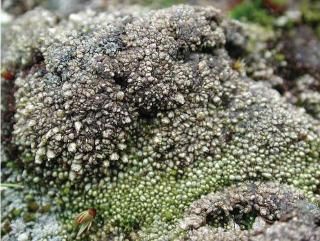
FIGURE 1. Prasanthus suecicus (Gottsche) Lindb.

& Piippo 1989), and coordinators of the Early Land Plants Today project. The family is here circumscribed to include ten genera. This includes: four monotypic genera of Poeltia Grolle, Nothogymnomitrium R.M.Schust., Nanomarsupella (R.M.Schust.) R.M.Schust., and Paramomitrium R.M.Schust.; Prasanthus Lindb. with 2 species (Fig. 1); Acrolophozia R.M.Schust. with 3 species; Apomarsupella R.M.Schust. and Herzogobryum Grolle each with 5 species; and the two larger and more widespread genera, Gymnomitrium Corda (Fig. 2) and Marsupella Dumort. (Fig. 3), each with 27 species.