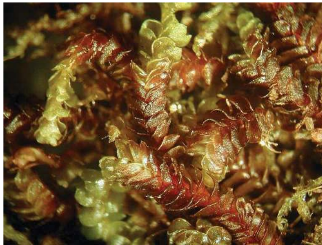
FIGURE 3. Marsupella aquatica (Lindenb.) Schiffn.

A brief synopsis of the historical and contemporary taxonomy and systematics of the family is provided. This is followed by brief, but noteworthy remarks on various aspects of the distribution, ecology, conservation, and biology of members of the family. The central part of the paper is in the detailed taxonomy and nomenclature of the close to 800 names associated with Gymnomitriaceae. It includes accepted names, synonyms, authorities, original citations, type data, references to relevant parts of the latest International Code for Botanical Nomenclature (McNeill et al. 2006), a 3-level coding system to indicate the level of knowledge about a taxon, as well as auxiliary data and annotations. There has been no prior publication that attempts to unify this vast amount of taxonomic and nomenclatural data in such detail for the family.