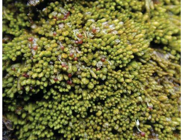
FIGURE 2. Gymnomitrium concinnatum (Lightf.) Corda.