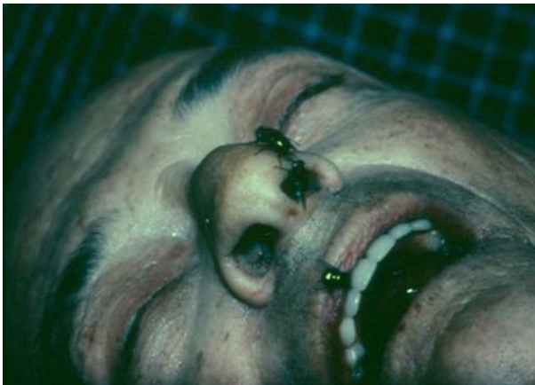
Fig. 9 Adult females Calliphoridae entering nasal openings to oviposit during Fresh Stage of decomposition.

hatch and there is internal feeding activity, although there may be little evidence of this on the surface.