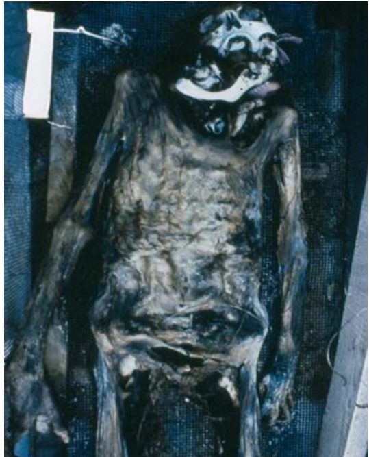
Fig. 12 Body in Postdecay stage of decomposition.

As the body is reduced to skin, cartilage and bone, the Diptera cease to be the predominant feature. In xerophytic and mesophytic habitats, various groups of Coleoptera will replace them, with the most commonly seen being the species in the family Dermestidae. These arrive as adults during the later stages of the Decay Stage but become predominant as adults and larvae during the Postdecay Stage. Their feeding removes the remaining dried