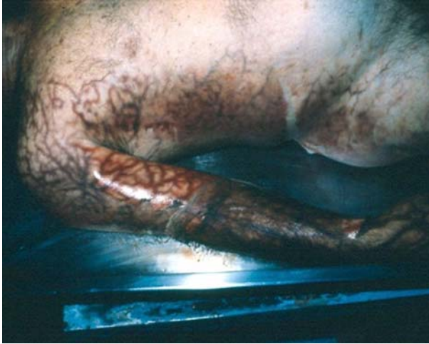
Fig. 5 Post-mortem marbling of body.