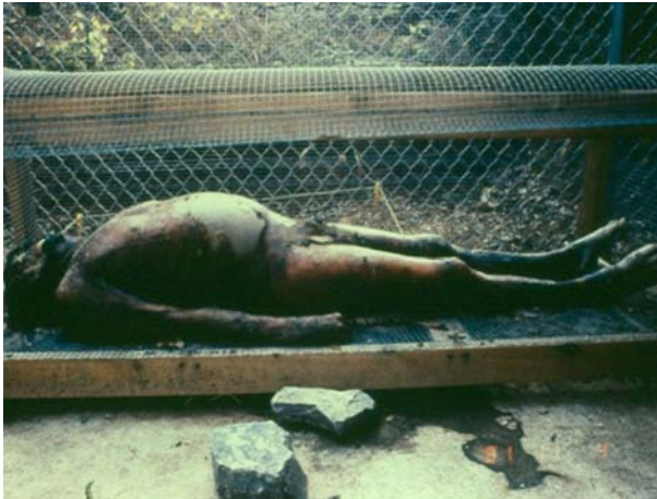
Fig. 10 Body in Bloated stage of decomposition.

cause an increase in the internal temperatures of the body. These temperatures can be significantly above ambient temperature ( >50^{\circ}\text{C} ) and the body becomes a distinct habitat, in many ways independent of the surrounding environment. The adult Calliphoridae are strongly attracted to the body during this stage in decomposition and significant masses of maggots are observed associated with the head and other primary invasion sites. While these populations are visible externally, there are larger populations present internally. Internal pressures caused by production of gasses result in the seeping of fluids from the natural body openings during this stage and the strong smell of ammonia is noted. These fluids seep into the substrate beneath the body and this becomes alkaline. The normal soil fauna will leave the area under the body as a result of this change in the pH and the invasion of a set of organisms more closely associated with decomposition begins.