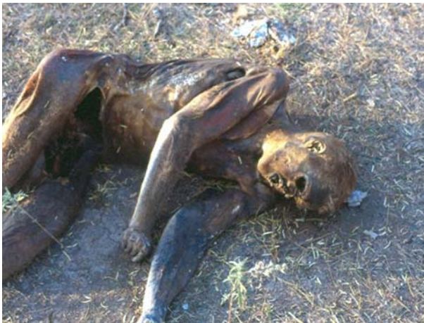
Fig. 6 Mummified body