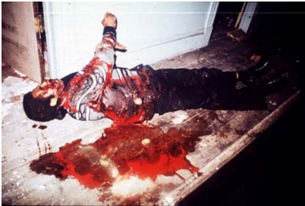
Fig. 2 Body showing rigor mortis.

prior to death, the onset of rigor is more rapid. Body mass and rates of cooling following death also influence the onset and duration of rigor mortis. As rigor disappears from the body, the pattern is similar to that seen during the onset, with the muscles of the face relaxing first.