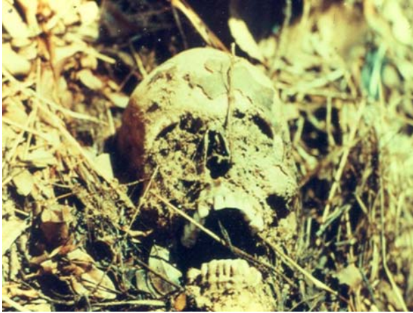
Fig. 13 Skull in Skeletal/Remains stage of decomposition

flesh and cartilage from the bones and the scraping of their mandibles leaves the bones with a cleaned, polished appearance. In wet habitats (swamps, rainforests, etc.), the Coleoptera typically are not successful. They are replaced in the process by other groups of arthropods. These include several Diptera families, such as the Psychodidae, along with their respective predator/parasite complexes. Associated with this stage in both types of habitat is an increase in the numbers and diversity of the predators and parasites. The soil-dwelling taxa increase in number and diversity during this stage.