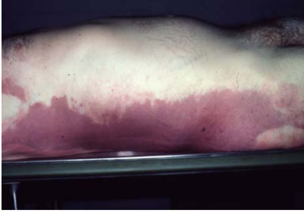
Fig. 1 Livor mortis with body lying in supine position showing settling of blood to lower portions.