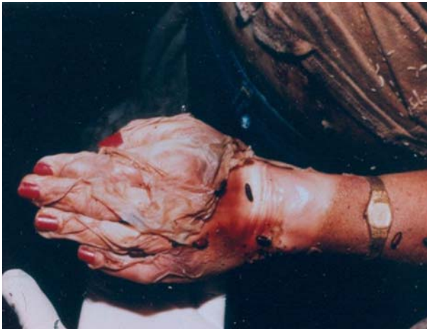
Fig. 3 Skin slippage on hand resulting in glove formation

The outer layer of skin, stratum corneum , is dead. It is supposed to be dead and fills a vital role in water conservation and protection of the underlying (live) skin. This layer is constantly being shed and replaced by underlying epidermis. Upon death, in moist or wet habitats, epidermis begins to separate from the underlying dermis due to production of hydrolytic enzymes from cells at the junction between the two layers. The epidermis can then easily be removed from the body. Slippage may first be observed as the formation of vesicle formation in dependent portions of the body. In some instances, the skin from the hand may separate from the underlying dermis as a complete or relatively complete unit. This is termed