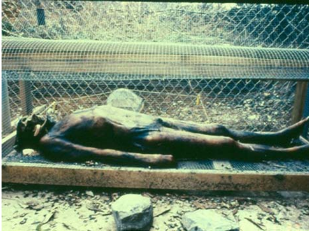
Fig. 11 Body in Decay stage of decomposition.