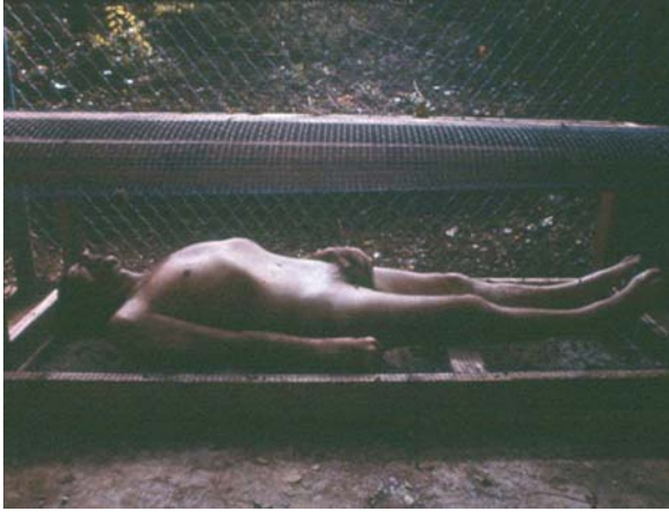
Fig. 8 Body in Fresh Stage of decomposition.