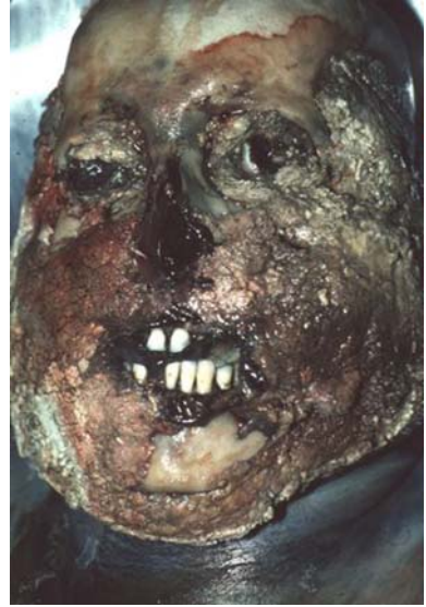
Fig. 7 Saponification in submerged remains.