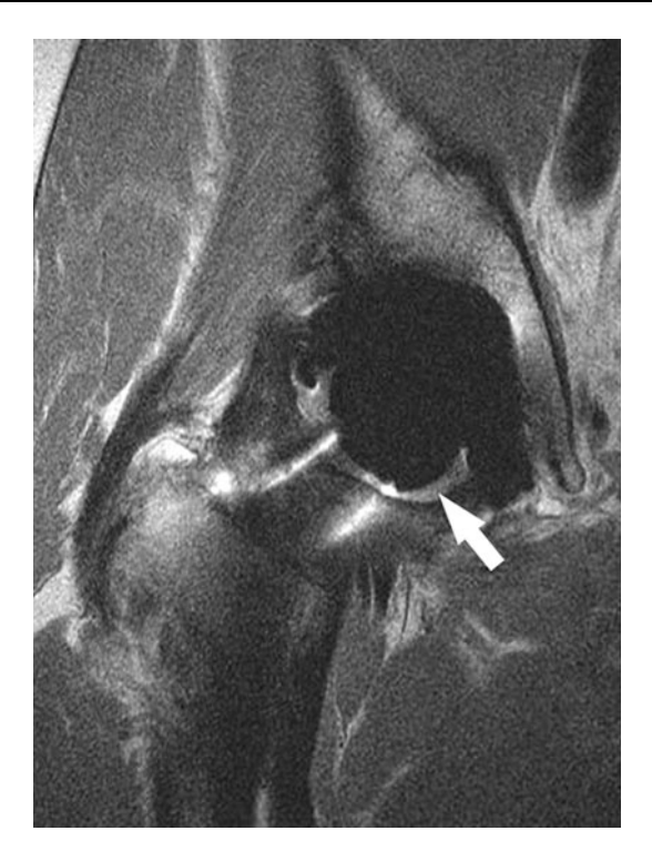
Fig. 1 This coronal MR image of a hip arthroplasty demonstrates intermediate signal intensity within the synovial lining and a moderately distended hip joint (arrow), consistent with synovitis.